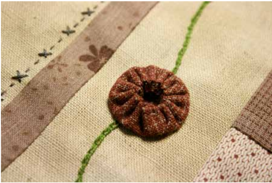
10) Position the yoyo