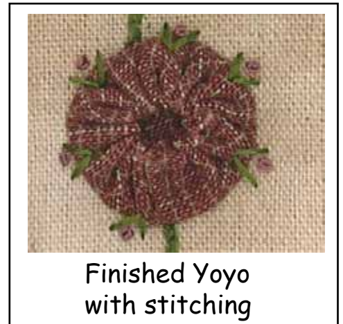
Finished Yoyo with stitching