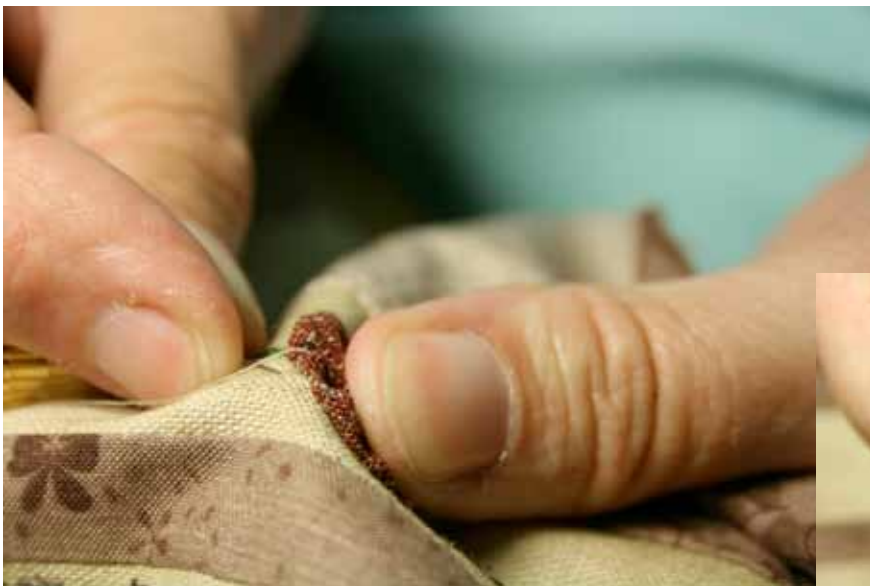
12) & 13) Continue stitching the yoyo in place on the background fabric