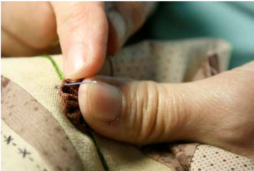
11) Stitch in place by just catching the edge of the yoyo