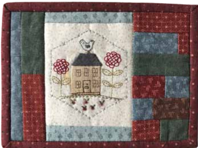
Home Sweet Home - a stitching for a mug rug approx. finished size of a mug rug is 6” x 8”

Sometimes called a “snack mat” it is a mini quilt, a little larger than a coaster, but smaller than a placemat. It’s just the right size for a cup or mug of whatever you are drinking (perhaps even a glass!), plus a spoon, and of course a little treat (chocolate or biscuit anyone?).